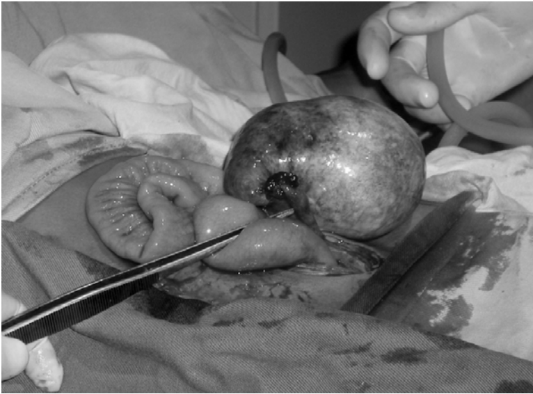
Figure 1: Intraoperative image of right ovarian mass measuring 60x45mm.