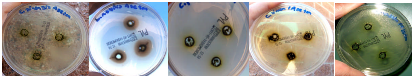
Figure 1: Antimicrobial activity of acetone extracts against, Helicobacter pylori

a) C. sinensis , b) L. nobilis , c) C. unshiu , d) C. limon , e) C. paradisi